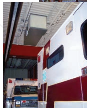
Model 2500 DS