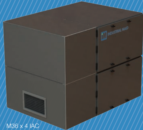
M36 x 4 IAC

Welding Smoke & Fumes Oil Mist Machine Grit/Smoke Odors & Vapors Process Dusts