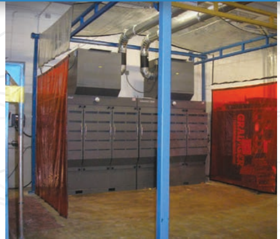
EB 56 Backdraft Application

We provide simple, safe and functional solutions for your production facility. Call our experienced staff today to discuss your specific needs and concerns.