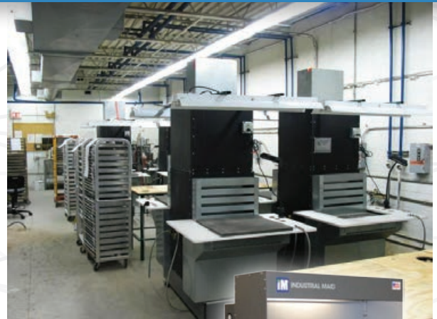
M36 PAC Downdrafts

The casters allow for portability and a dust dump tray helps collect any larger particles. It is a simple, cost-effective unit with a proven track record in all types of industrial air filtration applications.