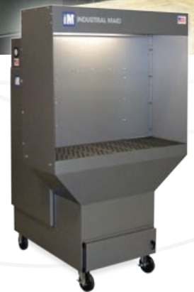
M36 PAC Hood Enclosure