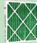
Pleated Panel Filter